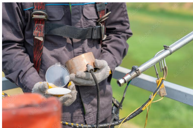
Fig 4. Field sampler assembling sampling probe and inlet filter for OTM-50 canister sampling.

Sample collection for OTM-50 is relatively simple compared to the EPA companion method OTM-45. A 1.4L evacuated canister is connected to the sampling port of a stack via a heated probe tube fitted with a particulate filter. After purging the equipment, a sample is collected with sampling time ranging from a few minutes up to one hour, until a final canister pressure of 5-8 inches of mercury is achieved. Background and duplicate samples are recommended and an intermediate impinger may be required in cases of high moisture or acid gases. Canisters and fittings are provided by ALS (cleaned, proofed, and ready to use), using dedicated coolers for transport to eliminate cross-contamination from other samples.