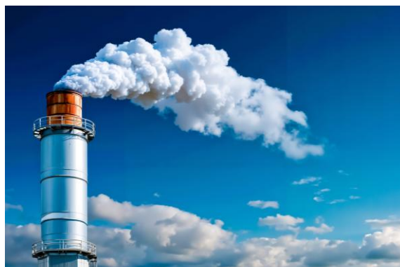
Fig 1. Industrial Emissions – potential source of volatile PFAS

that PFAS are fully eliminated before stack emissions enter the atmosphere. While destruction of precursor PFAS contaminants is feasible at lower temperatures, complete destruction of the intermediates, which are also mostly organofluorine compounds, requires a much higher temperature. If full mineralization is not achieved, incineration or other destruction technologies can simply transform and recycle PFAS back to the environment via the atmosphere in other forms.