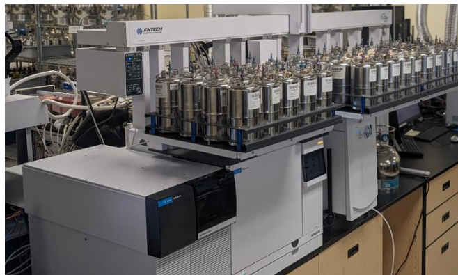
Fig 5. Automated GC-MS/MS instrumentation for OTM-50

Please contact your ALS Project Manager for more information about this important new test service.