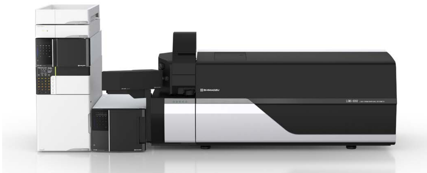
PFAS Analysis is performed using LC/MS/MS instrumentation