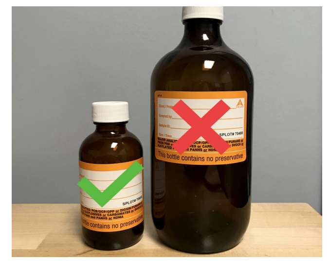
Figure 2: New 100 mL bottle and old 500 mL bottle

Water samples for our Trace OCP method should be collected using 100 mL amber glass sample bottles which have been validated for suitability by ALS. For groundwater sampling, exclusion of sediment is important to avoid a potential for high bias of hydrophobic OCPs, which may be sorbed to particulate matter. Low flow sampling techniques are recommended to minimize disturbance and uptake of sediment. Sample filtration is not permitted for OCPs due to potential sorption to filtration media. Chlorinated waters should be preserved with sodium thiosulfate to reduce any residual free chlorine. Holding time for this test is 7 days (14 days for Ontario MOE applications).