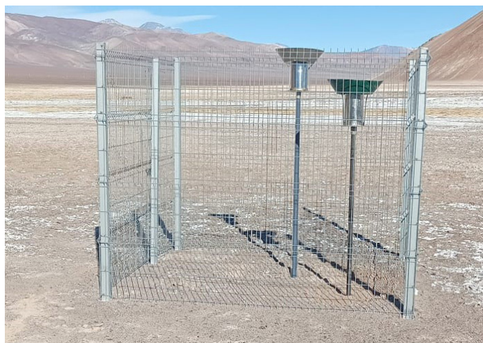
Fig 3. Duplicate Dustfall Samplers near a Mine

After the sampling period, the canister is taken down and closed with lid secured. Samples are shipped to the laboratory with a chain-of-custody (CoC) form listing sample IDs, dates, and requested analyses (e.g., dustfall particulate species, metals). Detection limits for gravimetric dustfall fractions are ~0.1 mg/dm 2 -day.