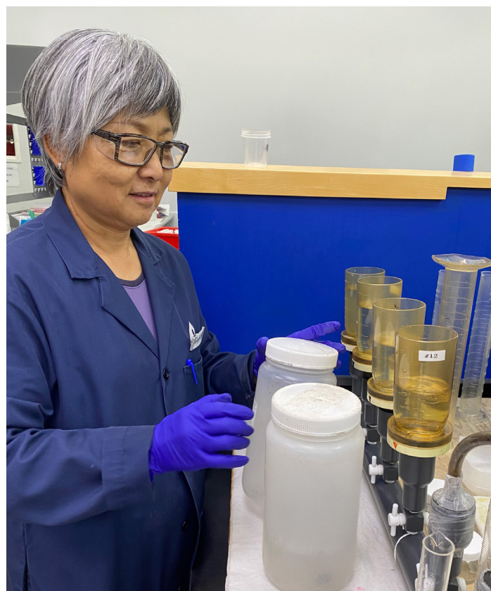
Fig 1. Dustfall analysis

The standard method for dustfall analysis uses a passive collection technique, typically following ASTM D1739, Standard Test Method for Collection and Measurement of Dustfall , 1 which involves exposing an open container to the air for a fixed period (usually 30 days) to collect settling particles. The sample container is partially filled with deionized water (with additives) so that settling dust is captured in the liquid. After the exposure period, the entire contents (liquid plus settled dust, including any rain or snow) is sealed and sent to a laboratory for analysis. The lab sieves out extraneous materials larger than ~ 1 mm and evaporates the sample to accurately weigh the collected particulate. Results are reported as dustfall deposition rate, typically in milligrams per square decimeter per day ( mg/dm^2 -day).