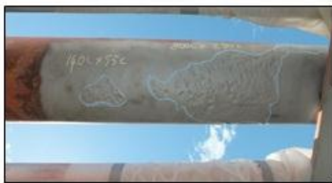
Corrosion Detected - Post-Blast