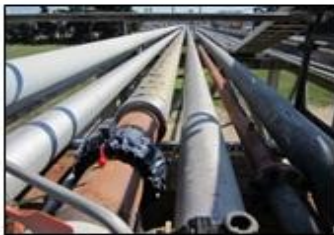
Probe Collar in position

Since the beginning of 2012, the ALS Advanced Inspection team has been performing GWT inspections using the GUL G4 system, operated by an experienced Level II Specialist throughout Australia and across a wide range of industries. GWT is a rapid 'screening' tool, used as a first pass inspection method which, when supported by other techniques, is appropriate to validate the results obtained, and as well as fully understanding the limitations, can deliver a successful and reliable inspection strategy.