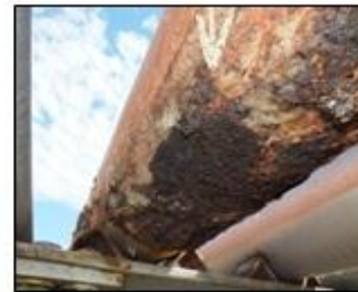
Corrosion Detected - Pre-Blast