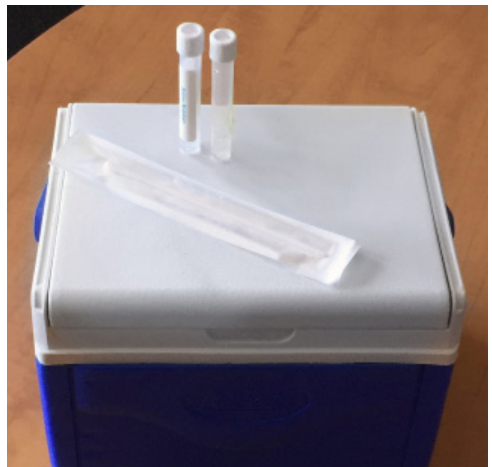
Sampling kits contain everything needed to collect surface swab samples.

RNA is converted into DNA using reverse transcription PCR (RT-PCR).