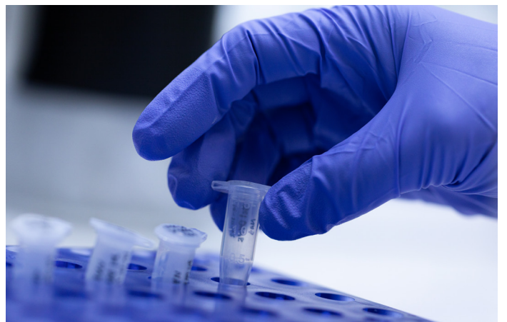
Results are reported as positive or negative with a positive result indicating the presence of SARS-CoV-2 genetic material.